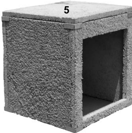
Completed Assembly with Oven